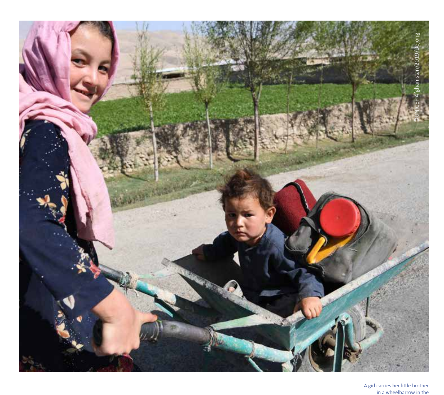
ASSISTING CHILDREN AT RISK

Efforts to end such harmful practices and protect children require close inter-action with local communities. A growing role is played by Child Protection Action Networks (CPANs), which operate across the country.